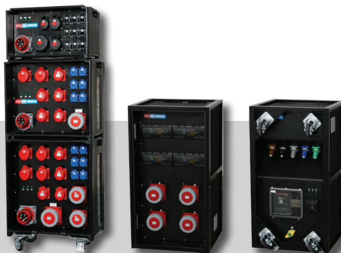
Further development of the SVE Family